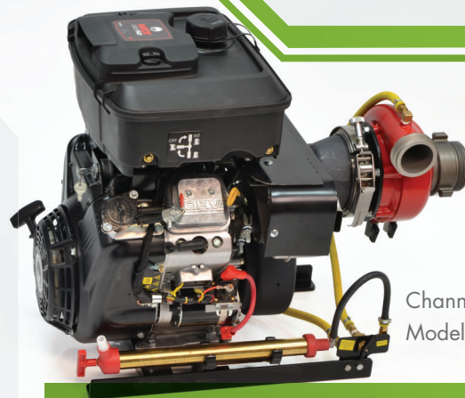
Channel Frame Model